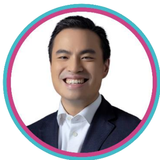
Mr. Akanat Promphan H.E. Minister of Industry