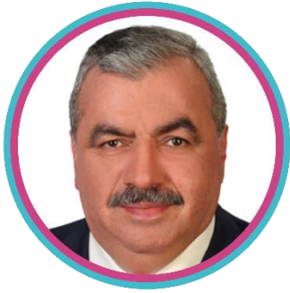
H.E. İhsan ÖVÜT

Secretary General of the Central Islamic Council of Thailand (CICOT)