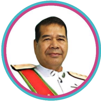
Police Major General Surin Palarae

Secretary General of the Central Islamic Council of Thailand (CICOT)